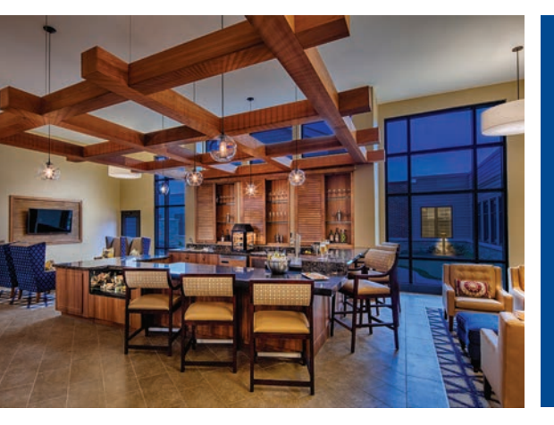
HarborChase of Shorewood Shorewood, Wisconsin

"We were very pleased to be able to maintain our pre-pandemic shareholder distribution rate, reflecting the company's strong financial condition, liquidity and financial flexibility."