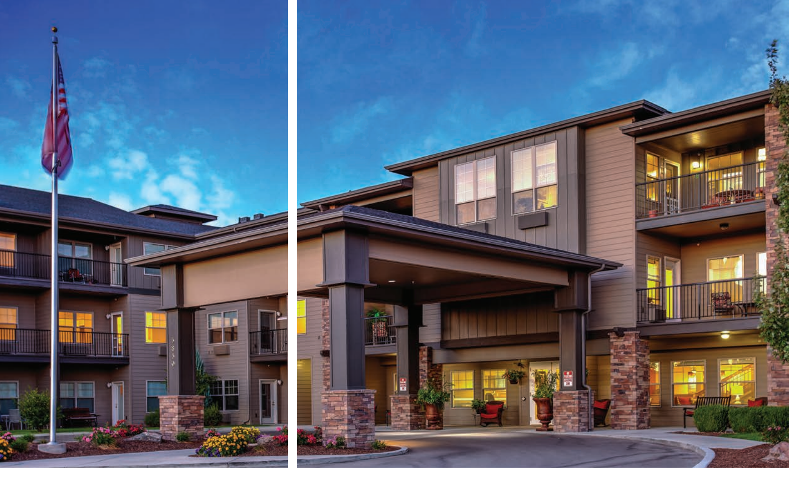
MorningStar of Boise Boise, Idaho